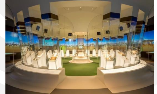
FIFA World Football Museum