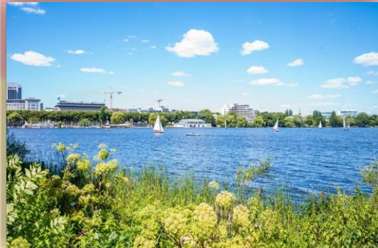
Outer Alastair Lake