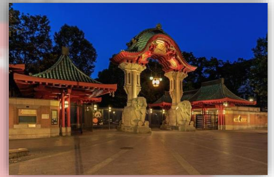
Zoologischer Garten Berlin