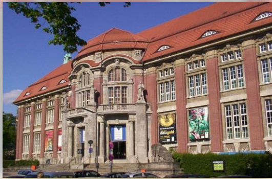
Museum am Rothenbaum