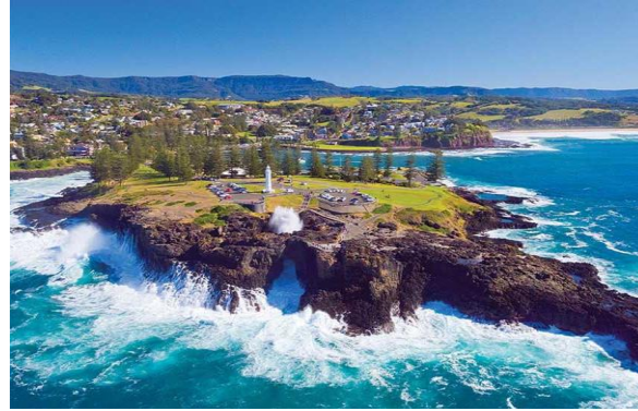
Kiama, New South Wales