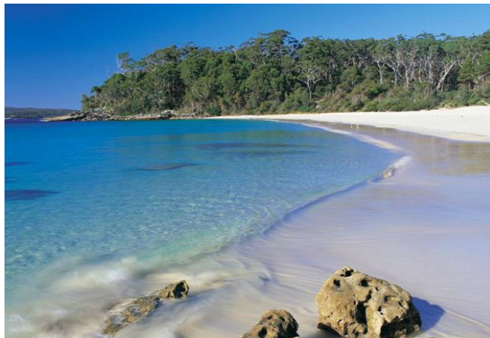
Jervis Bay, New South Wales