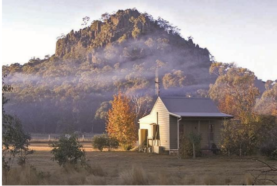
Hanging Rock, Victoria