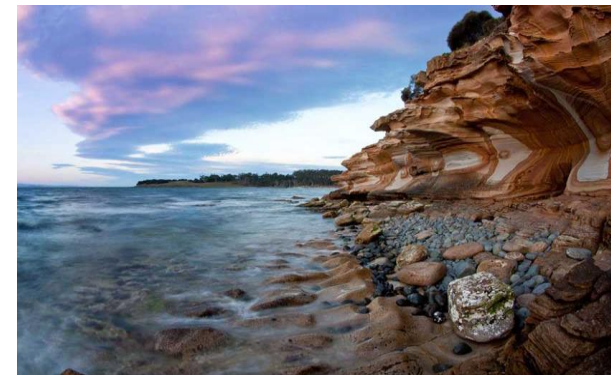
Maria Island, Tasmania