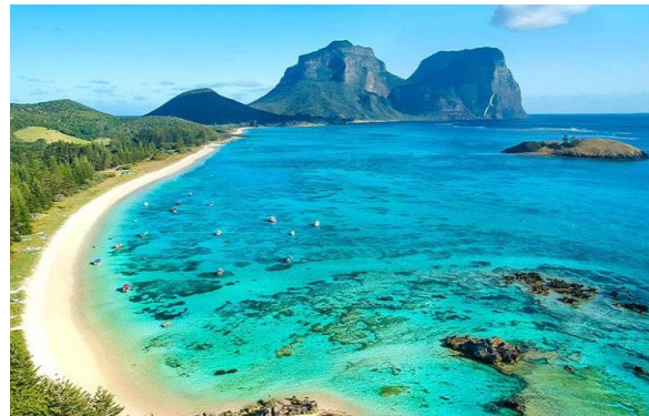
Lord Howe Island